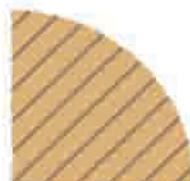
Quadrant 1 x 1m