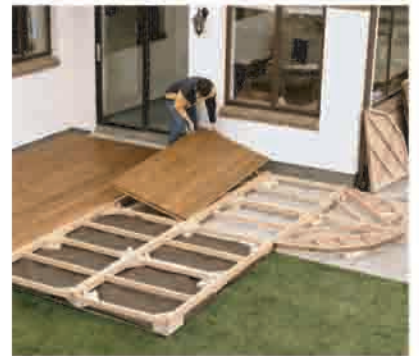
Top panels fixing