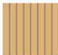
Half panel 1 x 1m