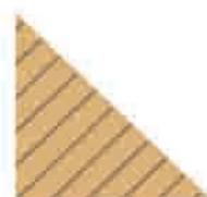
Triangle 1 x 1m